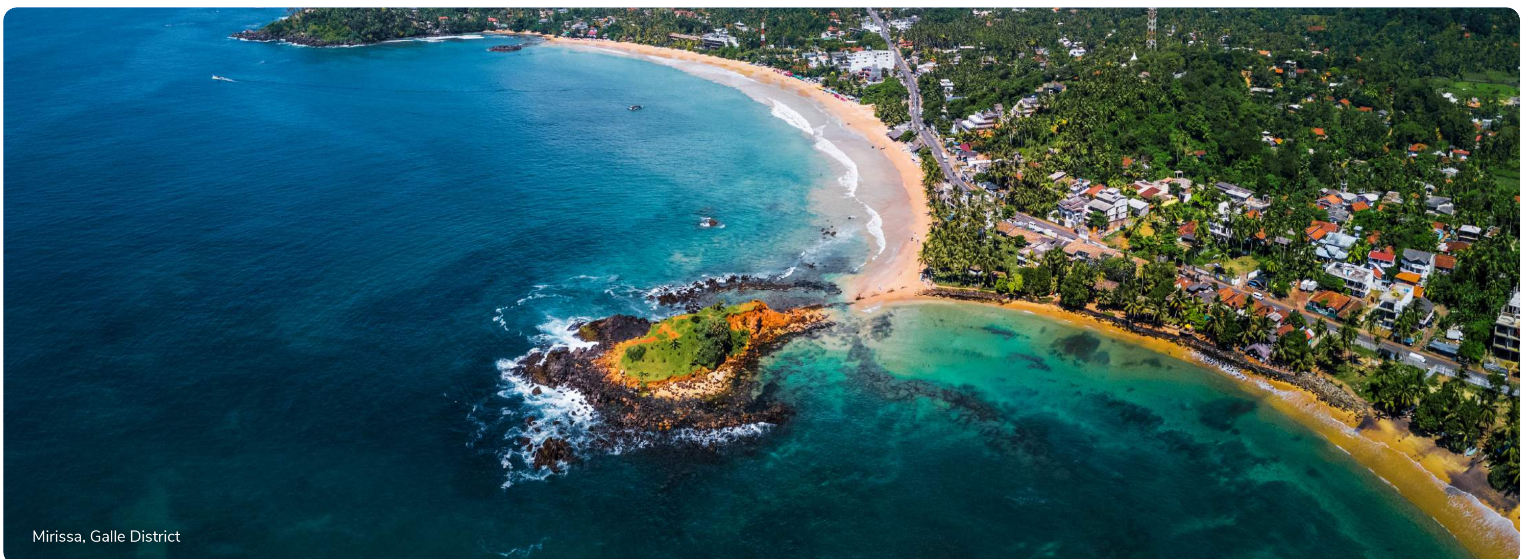
Mirissa, Galle District

Fully vaccinated travellers are allowed to make their own arrangements for accommodation, airport transfers and local transportation. However, advised to use safe and secure certified accommodations and travel agents to ensure their health and safety. (If fully vaccinated travellers are using "Safe & Secure Certified" L1 hotels / travel agents, airport transfers to be arranged by either the respective "Safe & Secure Certified" L1 hotel or travel agent)